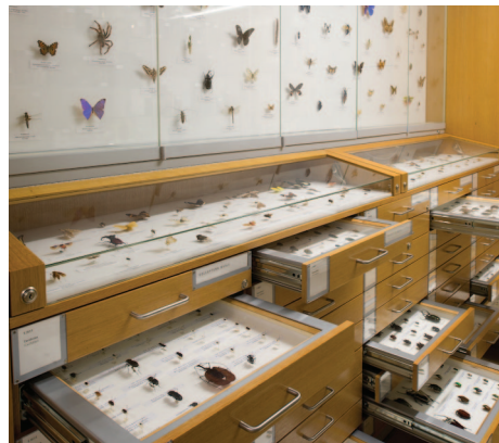
A reference collection as part of the permanent exhibition.

Beside these ~56,000 catalogued specimens there are still ten thousands of wasps in alcohol (e.g. from Northwest Germany and expeditions to Papua New Guinea and Costa Rica) waiting for preparation and identification – Microhymenoptera in particular. If you are interested in getting further information on the collection, visiting our museum, requesting a loan, or finding a place to deposit your (para-) types and other material please drop me a short line.