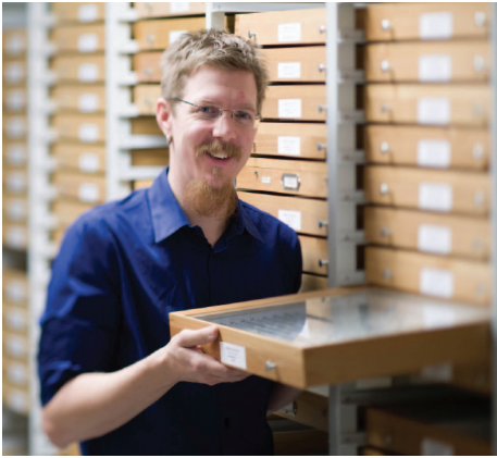
The new curator at UMB.