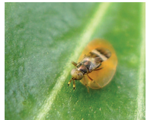
Encyrtid ovipositing.