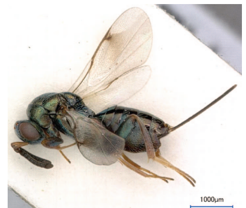
Female of Monodontomerus sp., taken on the Keyence digital microscope by Timea Szikora during the parasitic Hymenoptera course.