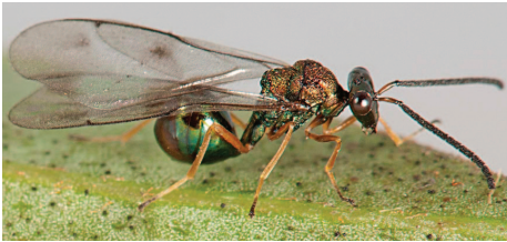
Orasema (Eucharitidae) female on Myrsine ; photo courtesy of Steve Marshall.