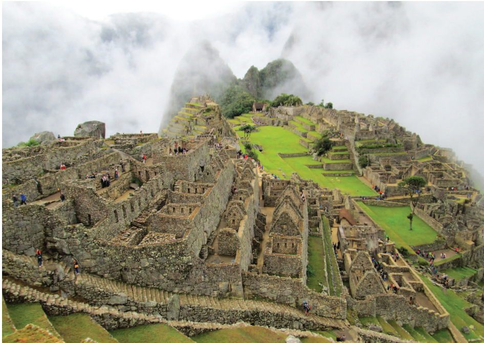
Machu Picchu, near Cusco, Peru, site of the 8th International Congress of Hymenopterists.