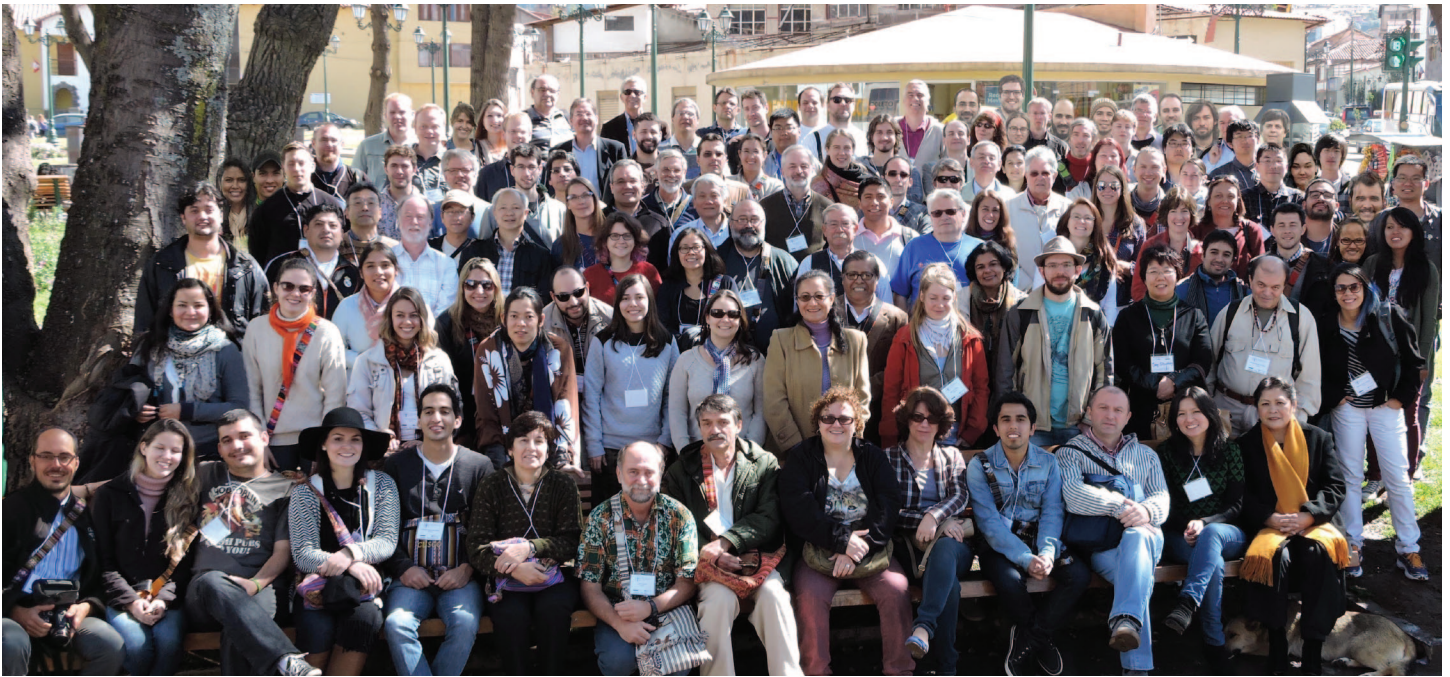
8th International Congress of Hymenopterists.