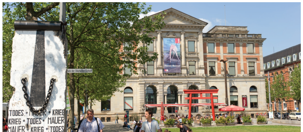
Historic building of the UMB (a part of the Berlin Wall on the left) (Photo: M. Haase, © Übersee-Museum Bremen).